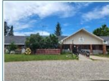
Wikwemikong Nursing Home, Wikwemikong