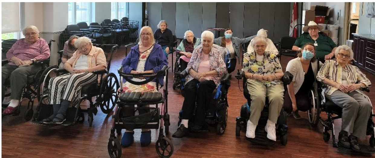
Trillium Care Community Residents' Council