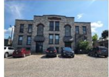
Manitoulin Lodge, Gore Bay