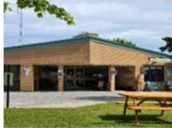
Manitoulin Centennial Manor, Little Current