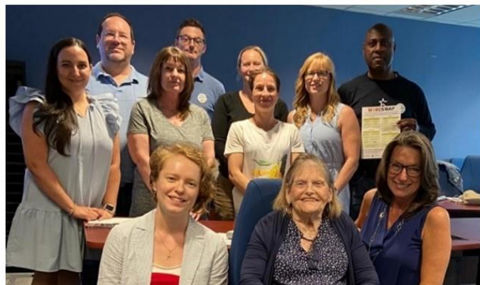
OARC and Ministry of Long-Term Care Investigators July 12, 2023