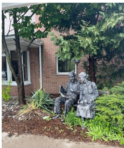
Gilmore Lodge, Grimsby