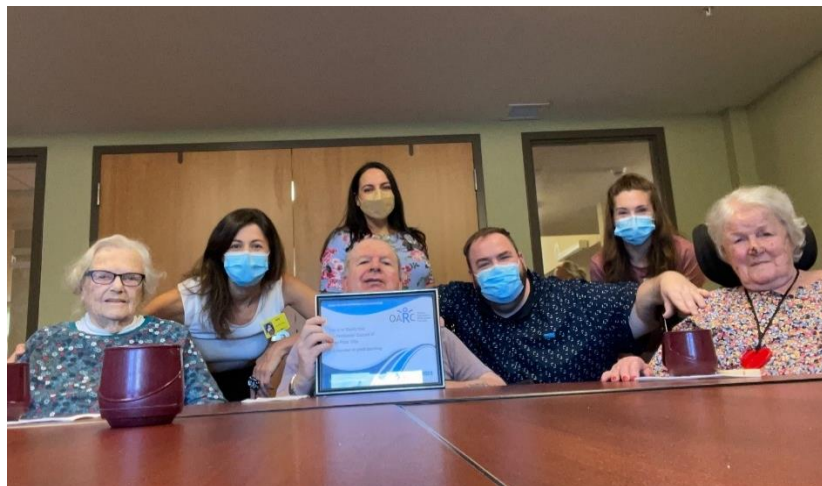
Residents' Council Team, Deer Park Villa, Grimsby