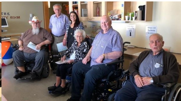
Resident Leaders at St. Joseph's Villa, Sudbury