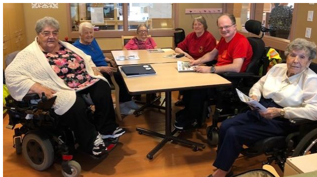
Resident Leaders at Villa St. Gabriel Villa, Sudbury