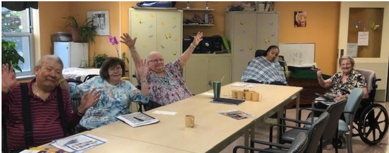
Pictured above: Resident leaders and Council members from Cumber Lodge, City of Toronto

The OARC Education team often receives inquiries from residents and their supportive partners, Residents' Council Assistants and Administrators, asking how to maximize the Residents' Council in their homes. Sometimes making small changes in the operations and governance structure of the Residents' Council can have a profound and positive effect.