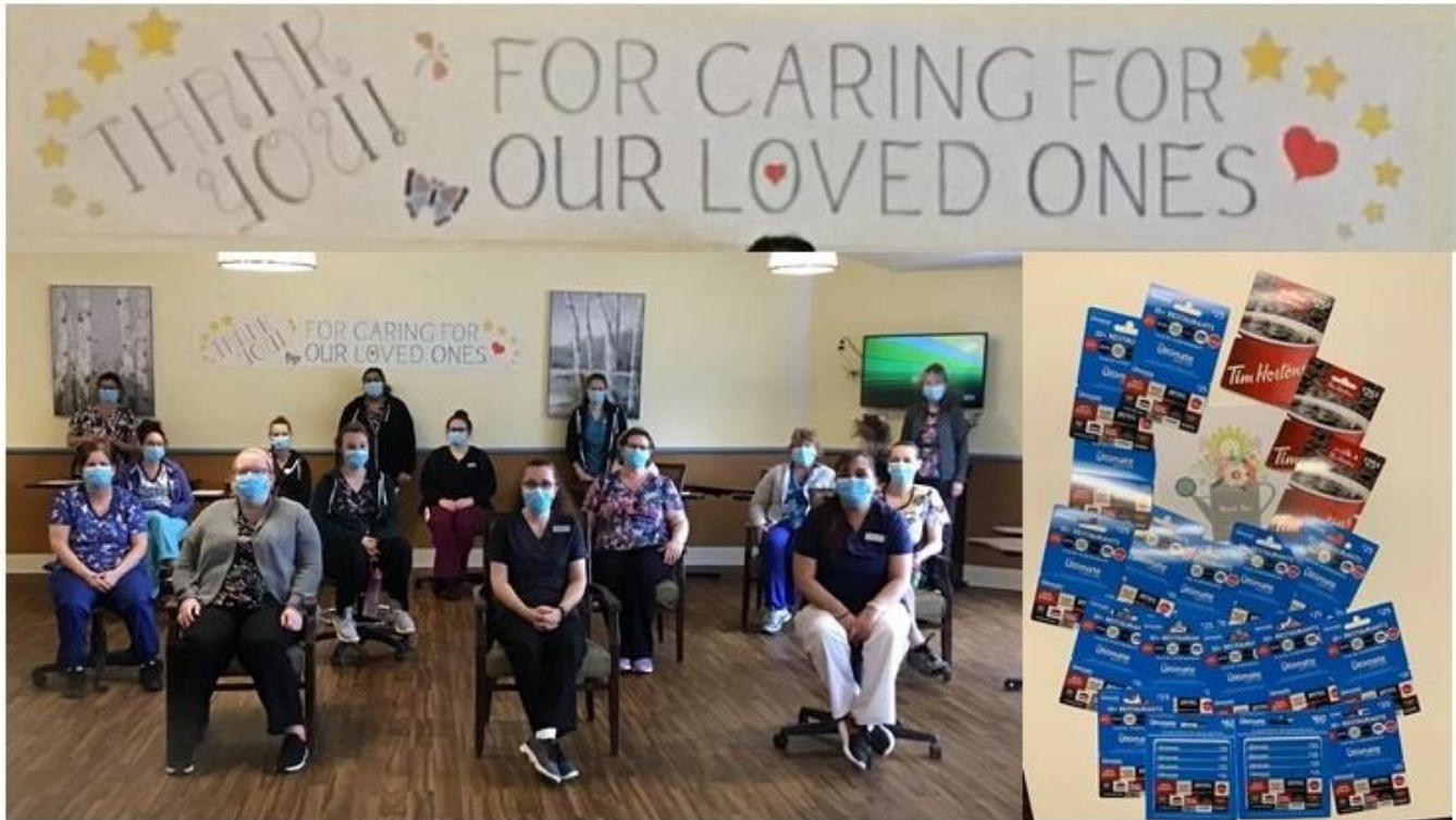
Celebrating Team Members at Cedarvale Lodge Retirement and Care Community