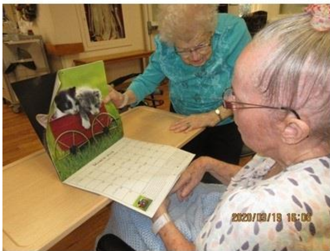
Helper and Comforter